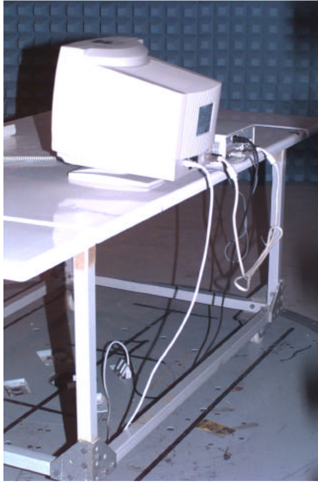
Rear/Side View w/o Ferrite Clamps on Power Cords