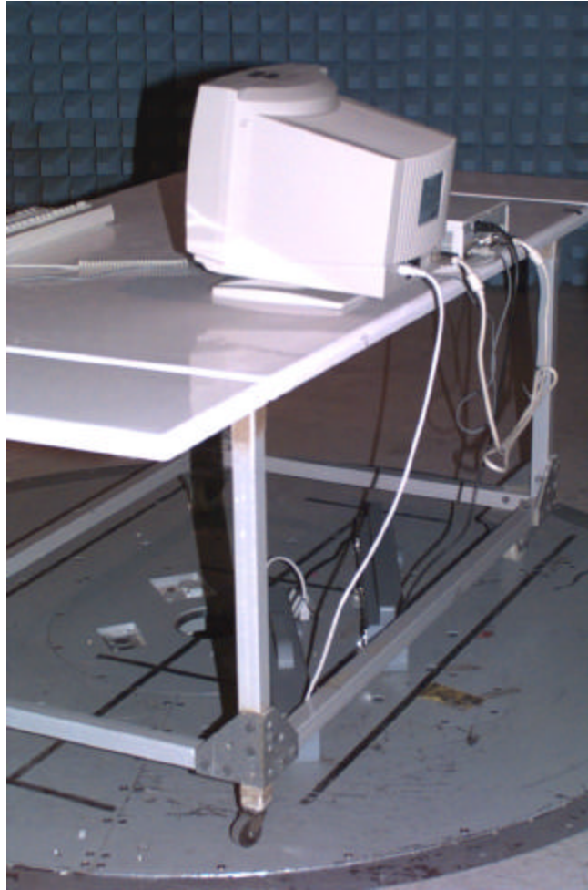
Rear/Side View w/ Ferrite Clamps on Power Cords