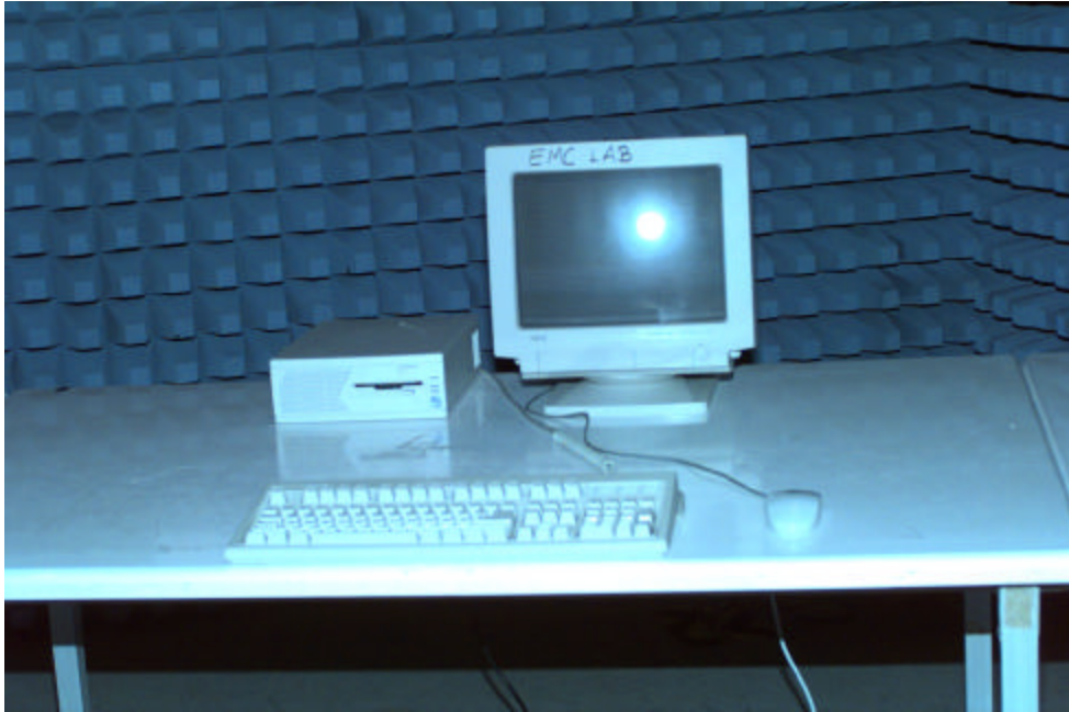
EUT Front View